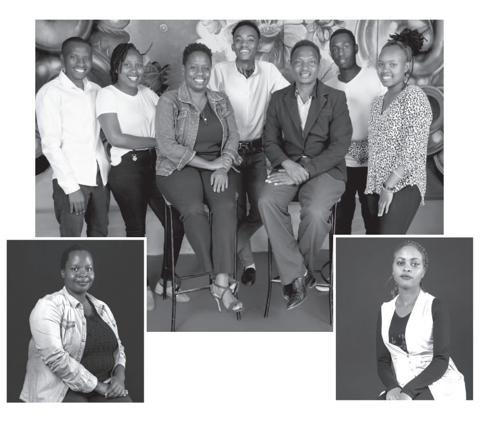
Class of 2019 Graduation Committee